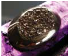
Natural Druzy Quartz stone