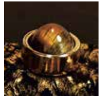
Tiger's Eye rivets